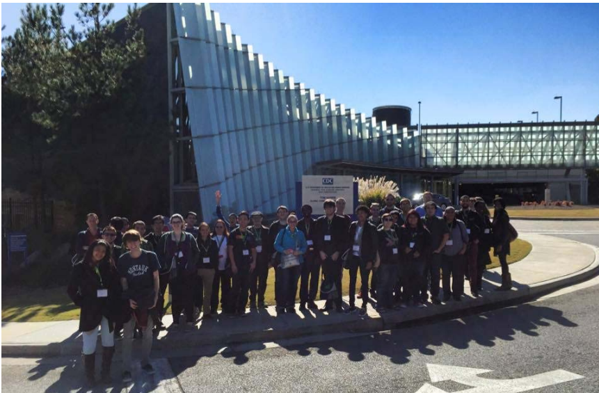
A group tour of the Centers for Disease Control and Prevention in Atlanta during the Out to Innovate™ Summit.

The Willamette University MBA STEM Scholarship program is a merit-based scholarship for eligible U.S. citizens or permanent residents who have completed an undergraduate major in a STEM area (science technology, engineering and mathematics) in the United States. Applicants who meet the criteria and are selected for this scholarship will receive a scholarship to the MBA program at Willamette University in Salem, Oregon, ranging from $23,000 (62% of tuition) to approximately $37,000 (100% of tuition). For more information about the requirements for this scholarship visit: http://willamette.edu/mba/full-time/financial_aid/scholarships/stem-scholarship.html . Applicants for admission interested in consideration for the Willamette MBA STEM Scholarship must complete their application process by February 15.