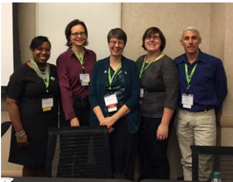
Speakers in the workshop on "LGBTQ+ in Your Professional Society" at Out to Innovate™