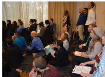
Standing room only at a workshop at Out to Innovate™.

Sunday, February 15, 3-5 p.m.: NOGLSTP Reception for LGBTQ+ people in STEM. Connect and network with LGBTQ+ scientists. Meet the movers and shakers of NOGLSTP, a AAAS affiliate and professional society that educates and advocates for LGBTQ+ people in science, technology, engineering, and math. Both AAAS meeting registrants and local LGBTQ+ people in STEM, as well as their companions and spouses, are welcome to attend. You do not need to be registered for the AAAS meeting to attend this reception. Hilton San Jose, Plaza Room.