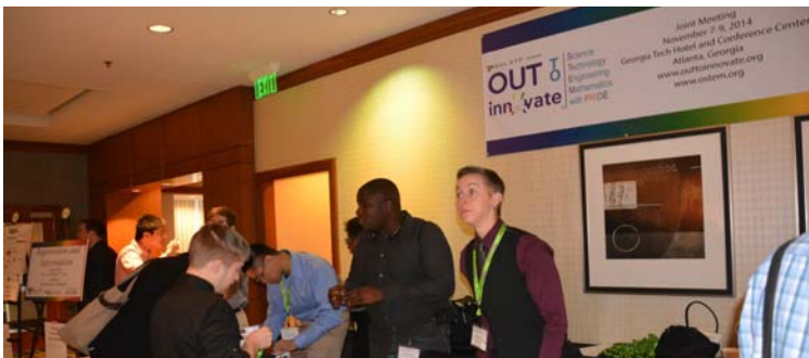
At the Out to Innovate™ conference registration table.